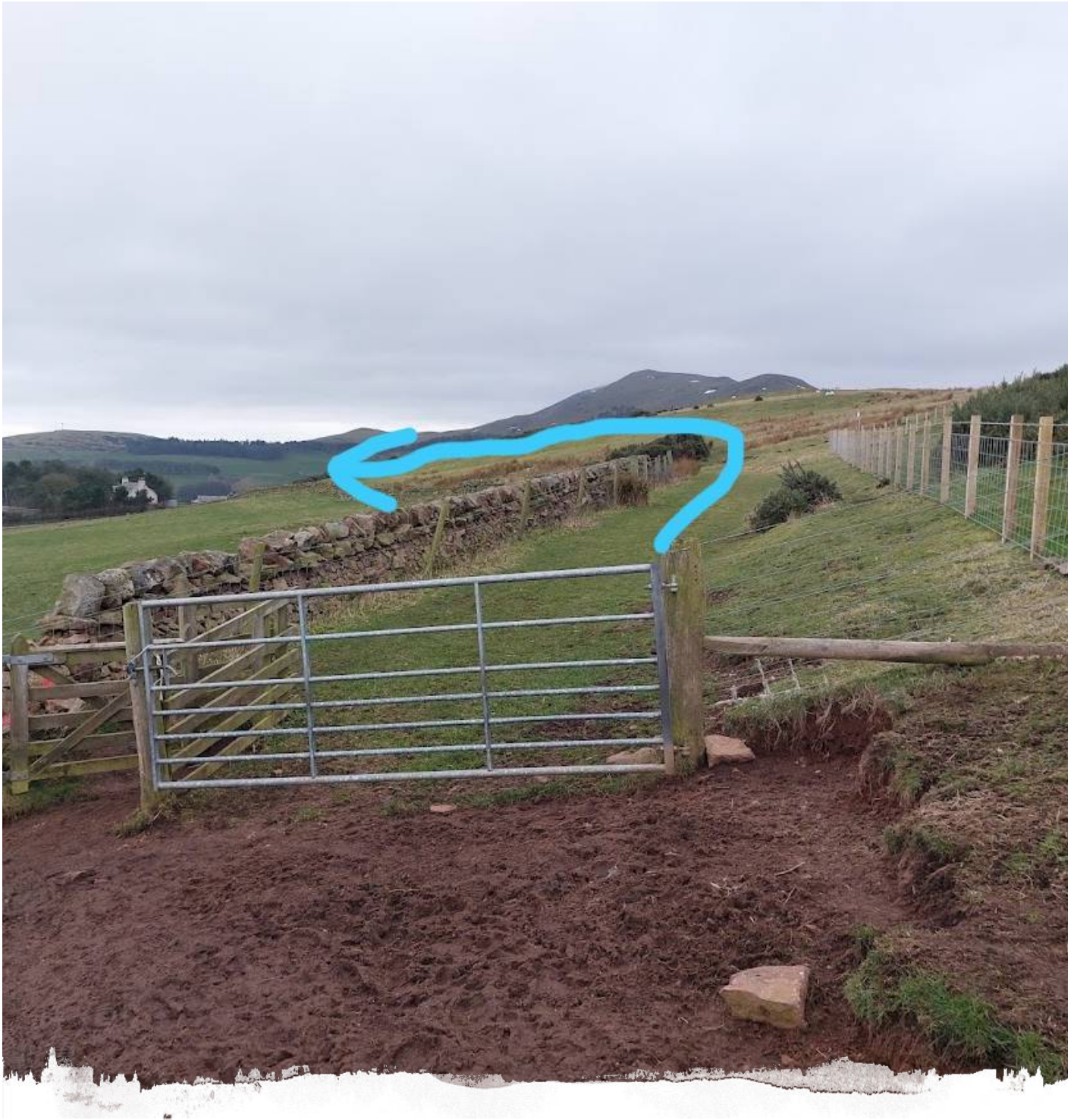
(10) From here you head back to Castlelaw car park, heading through one more gate on the way.